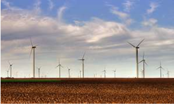
The Smoky Hills Wind Farm in Kansas.

NOAA, CIRES study: Sun and wind could provide most U.S. electricity by 2030 January 25, 2016